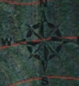
Exhibit A - County GIS (2019 Aerial Photo) Carbon Hill Road a.k.a. Beackton Hall Road